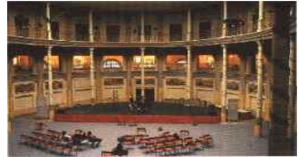
Casa dell'Architettura - Acquario Romano Piazza Manfredo Fanti, 47

Before the dinner a guided tour to the Domus Romane in Palazzo Valentini will be organised.