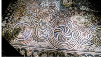
Domus Romane - Palazzo Valentini (detail) Via Foro Traiano, 85

Before the dinner a guided tour to the Domus Romane in Palazzo Valentini will be organised.